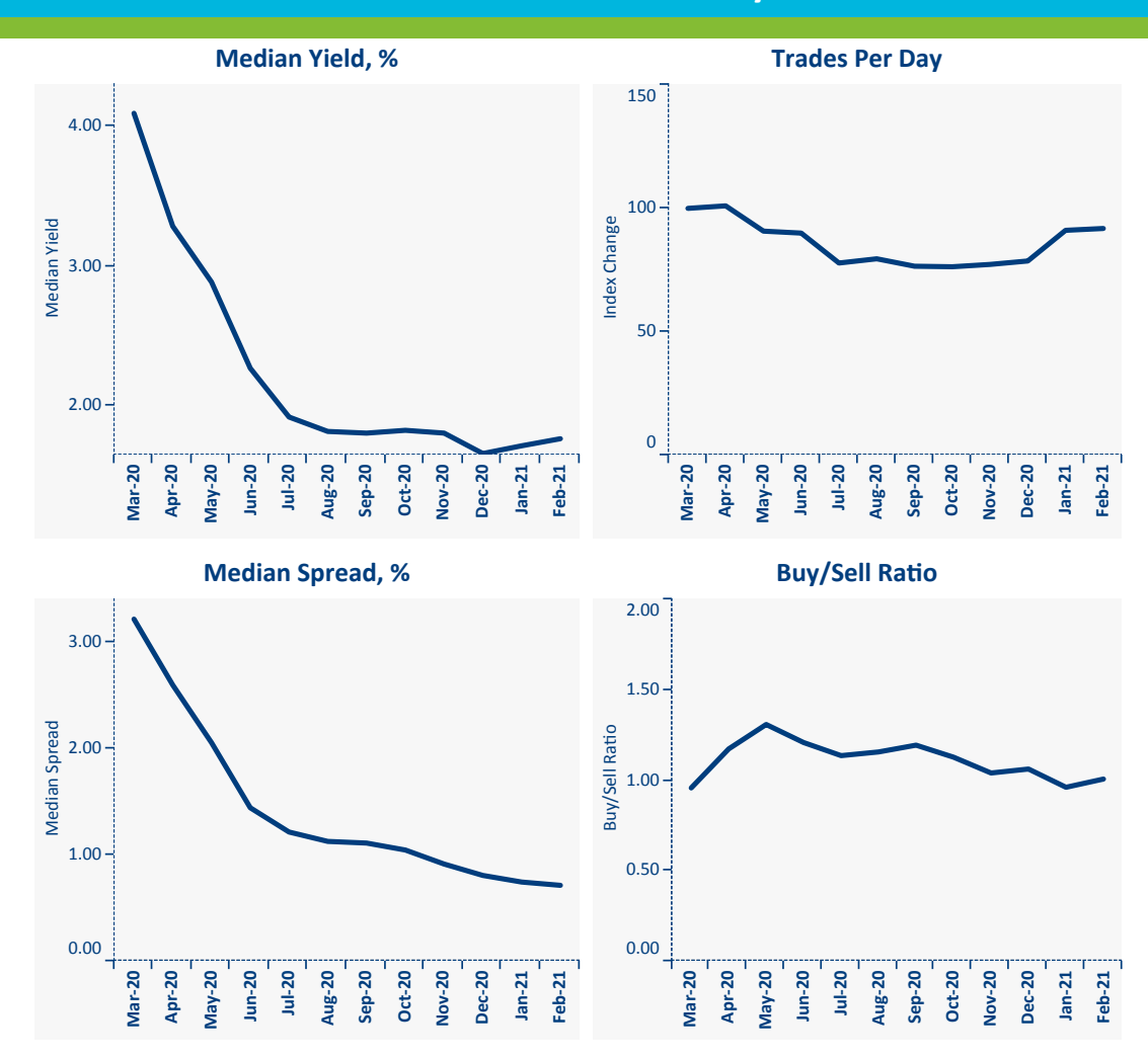
Daily Trades: First month = 100 Source: TRACE and Tradeweb Direct -Based on odd-lot customer transactions (<100M) reported in TRACE.