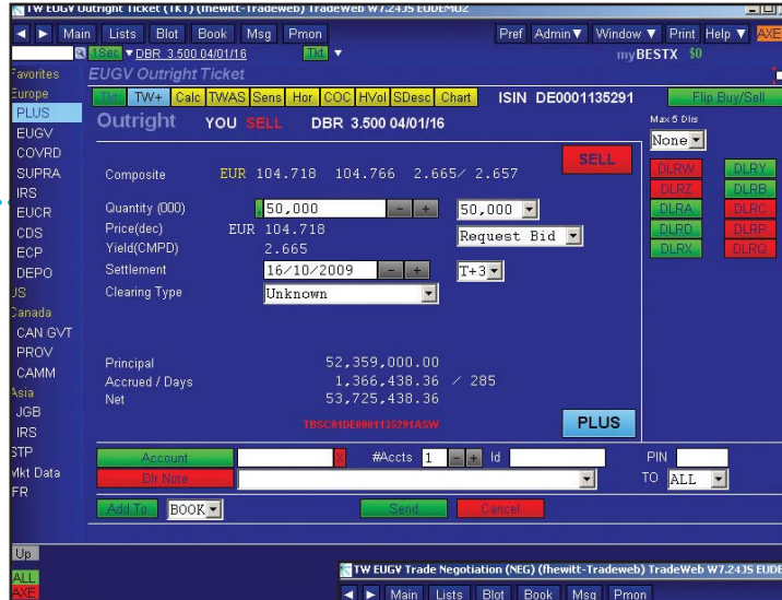
Trade Ticket Screen