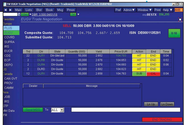
Trade Negotiation Screen