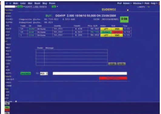
Trade Negotiation Screen