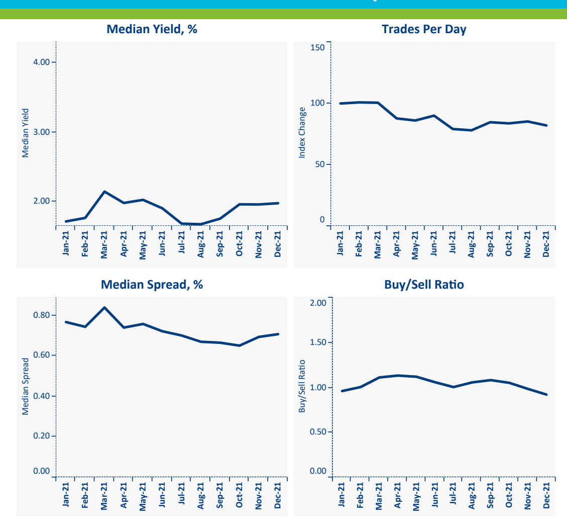
Daily Trades: First month = 100

-Based on odd-lot customer transactions (<100M) reported in TRACE.